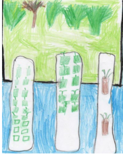
Art by Emma S.

Our teachers are using a hands-on, investigative science kit - Science 21 - in our classrooms.